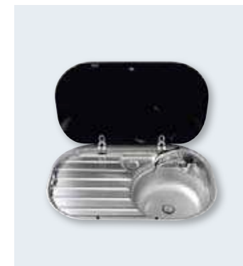
Sink with drainer and glass lid