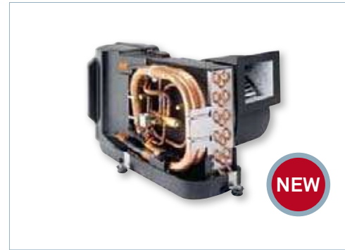
The award-winning Turbo is a self-contained air conditioning unit with a high-velocity rotatable blower, and a built-in vibration-isolation mounting system that reduces noise.