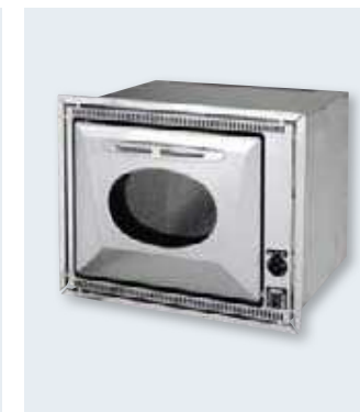
Oven with grill