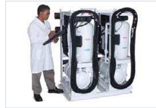
Two 20-ton MTS modular chilled water units mounted on a standard base and frame.