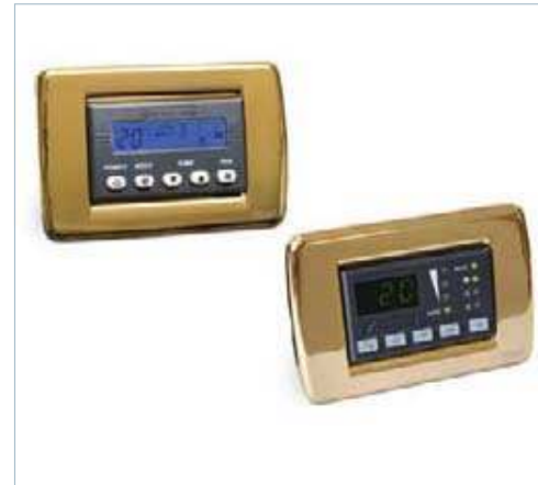
Cruisair Q-Logic and Marine Air Elite digital controls with decorative bezels.

Whether small pleasure craft, superyachts, or something in between, boat owners deserve the comfort and luxury of a climate control system from Dometic. Two world-leading brands – Cruisair and Marine Air – provide solutions that range from compact, self-contained units for small craft, to large, multistage chilled water systems for superyachts.